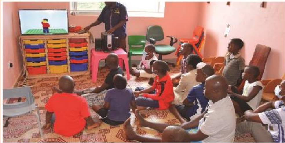
Children learning using television and radio at the centre.

Angels' centre supported over 55 children in early learning and integrated therapy to equip them with basic literacy skills, interpersonal skills as well as Speech and language.