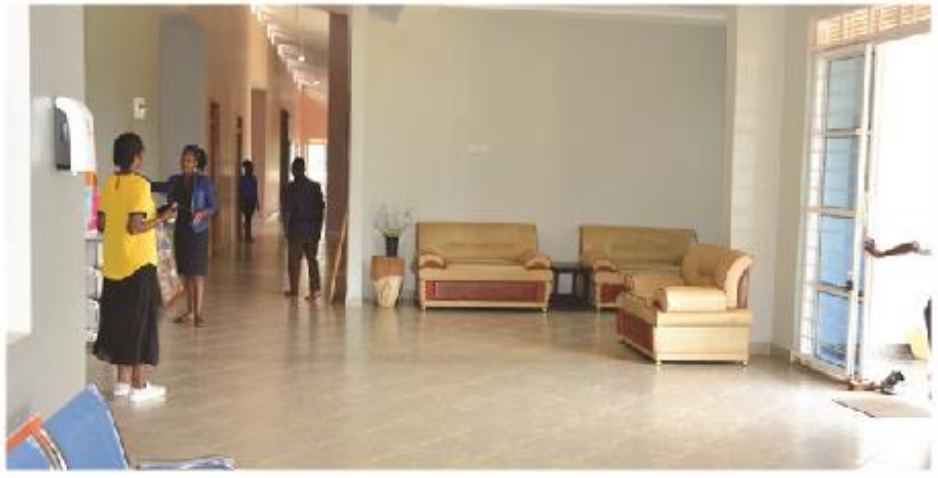
Part of the reception area and the corridor