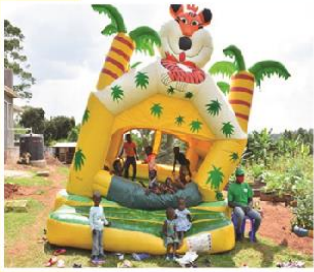
Children playing during the party

Despite the challenges and uncertainties of 2020, just like our culture has always been, the year was crowned with a Christmas party for the children in partnership with the Rugareria Foundation. It was a day filled with a lot of fun, play, eats and drinks. Over 100 families and children with special needs attended and every child went back home with a gift hamper from the Rugareria Foundation.