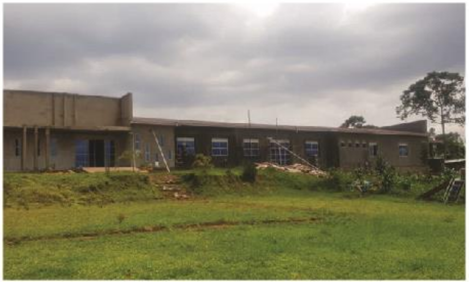
The outside view of the new Angel's center.