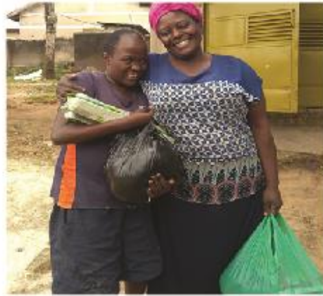
Parents and their children receiving food packages

ACCSN provided nutritious and balanced diet foods to over 150 families raising children with special needs to respond the constraints brought by COVID-19. The family relief packages contained food items like rice, maize flour, and sugar, washing soap, beans, salt, millet flour, groundnuts, cooking oil and powdered milk.