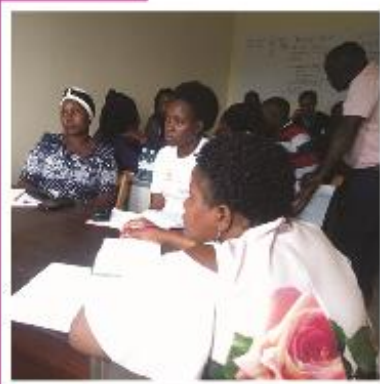
Participants during group discussions