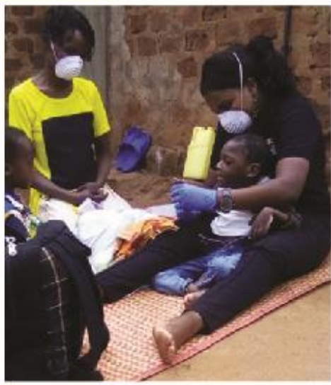
Therapists showing caregivers and siblings simple physio therapy skills for the children.

Cerebral Palsy Africa partnered with Angel's Centre for Children with Special needs (ACCSN) to provide home based care for 71 children with special needs in response to the effects brought about by the COVID-19 novel virus. The project aimed at increasing access to integrated therapy services such as physiotherapy, occupational therapy, speech and language, equipping 70 parents in offering home based therapy