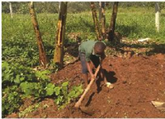
Shadati learning how to garden. Such skills also enhanced their physical and mental health.