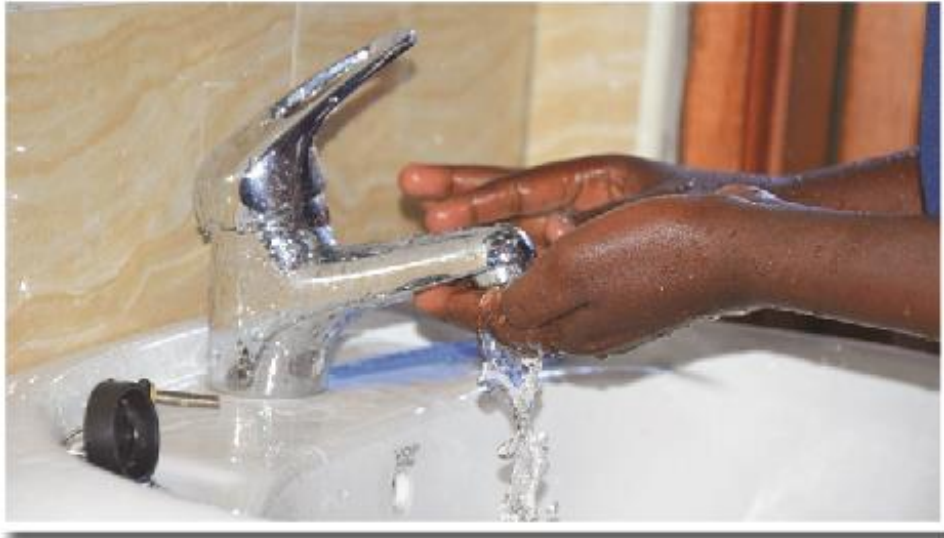
Tamale- beneficiary at ACCSN washing his hands at one of the sinks.

The routine learning sessions were however interrupted by COVID-19 restrictions and parents were not able to bring their children to the center for early learning and integrated therapy services for close to 4 months.