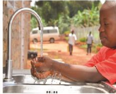
Participants learning how to wash their hands perfectly. This skill is key to enhancing hygiene especially for COVID-19 prevention and other hygiene related diseases.

Furthermore, we held engagement meetings with three employers for persons with Down syndrome on the importance of workforce development and providing internship, volunteer and employment spaces for them. Two of the employers provided employment spaces for two young adults to assist in office management and being messengers.