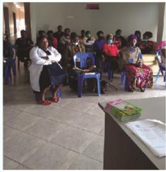
Participants during the parents' meeting at ACCSN