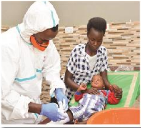
Therapist supporting a parent and child during the OPD at Angels' Centre