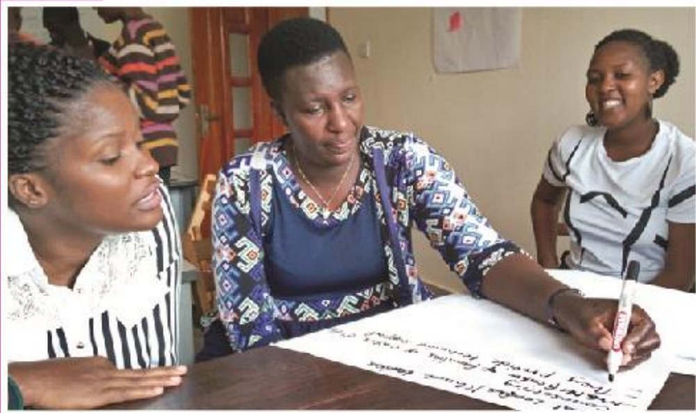
Participants doing group work during the training

To further strengthen our community based programming, 17 participants from Angel's Centre were supported by Cerebral Palsy to develop a Community Based Rehabilitation Strategy. The training was aimed at building the capacity of Angel's Center to develop, implement and monitor a Community Based Rehabilitation Strategy that was relevant to the needs and opportunities available in the community. The participants got more in understanding disability in Uganda, CBR matrix, importance of the International Classification of functional for disability and health to implement disability programs in a harmonized way and situation analysis and mapping of community resources. As a result, Angels' centre drew a CBR strategy.