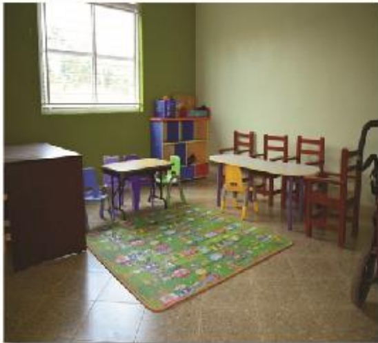
In the pictures above is one of the classrooms and one of the therapy rooms.

We are happy to inform you that we were finally able to achieve our long time dream of having our own fully furnished facility, "CENTER OF EXCELLENCE" that can accommodate at least 200 children with special needs. In July 2020 we moved from our former rented premises in Nansana municipality to a place we call home in Bulabakulu-Banda parish Wakiso district. The new facility has a number of rooms, among them are 3 therapy rooms, 4 class rooms, a sick bay, a social workers' office, a Director's office, a board room, a bigger reception with a kids corner, a dining/ common room, inside washrooms for both the children and the adults, an inside kitchen/staff cafeteria and 3 sleeping rooms for the weekly boarding program.