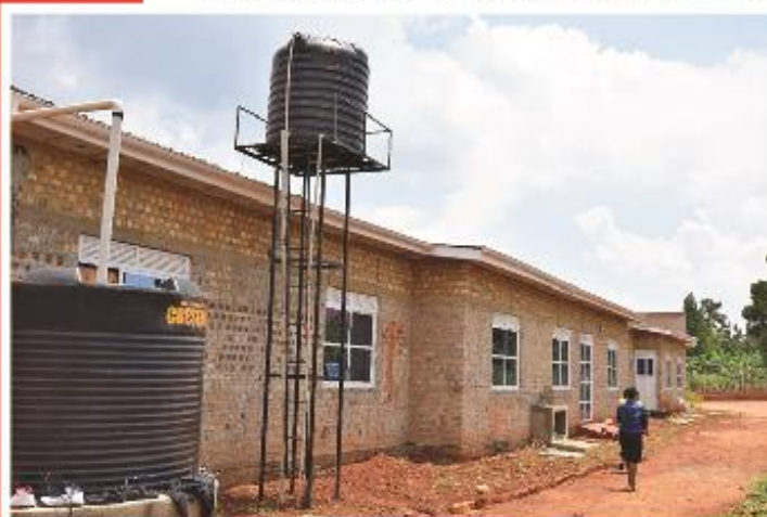
Tank installed to provide water at the centre

The plumbing has enabled timely access to water for the kitchen, toilets and bathrooms leading to improved hygiene among the children and the entire facility. In addition, children and caretakers have clean water for drinking.