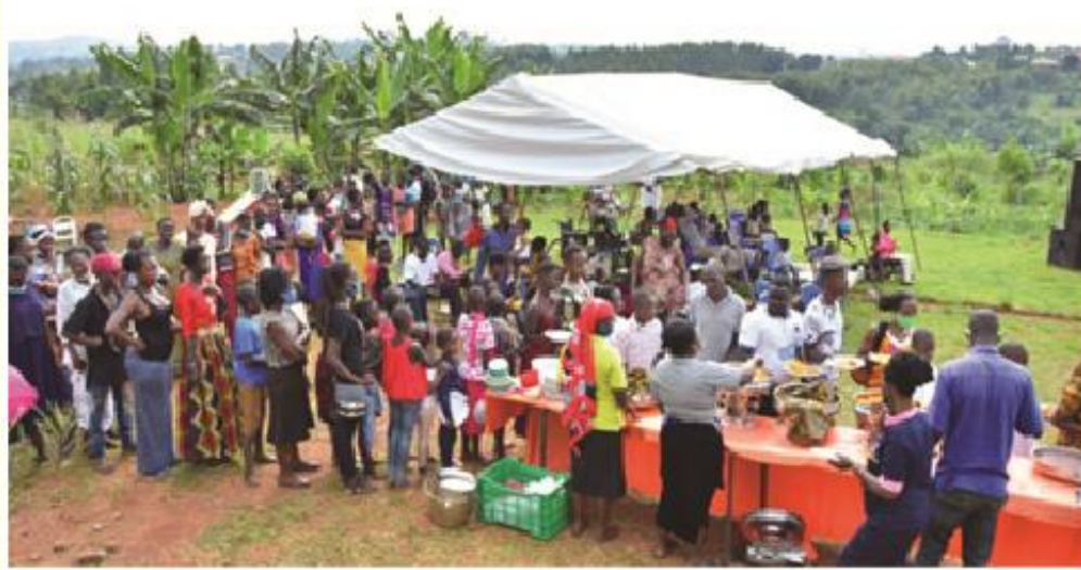
Parents and children enjoying a meal

What a way to wrap up the year! The purpose of the Christmas party was to celebrate with our families especially those that cannot afford a Christmas celebration in their homes to also have that amazing feel and for the children to remember and celebrate the birth of Jesus Christ irrespective of the situation and conditions they are going through.