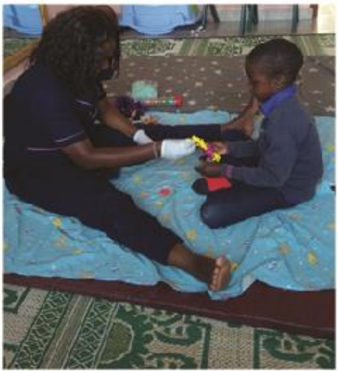
Therapist working with a child during the OPD sessions at Angels' Centre

We put in place an outpatient program to further increase access to physio and psychotherapy among children and parents. This was conducted on a weekly basis where each child and parent received specialized attention for at least two hours. Over 40 children were able to benefit from this program. With the help of the OPD, physical changes were observed among the children including reduced effects like contractures, malnutrition as well as behavioral change such as improved speech and performance of tasks. Moreover, parents were supported through counselling to cope with the overwhelming financial difficulties and emotional distress aggravated during the lockdown period.